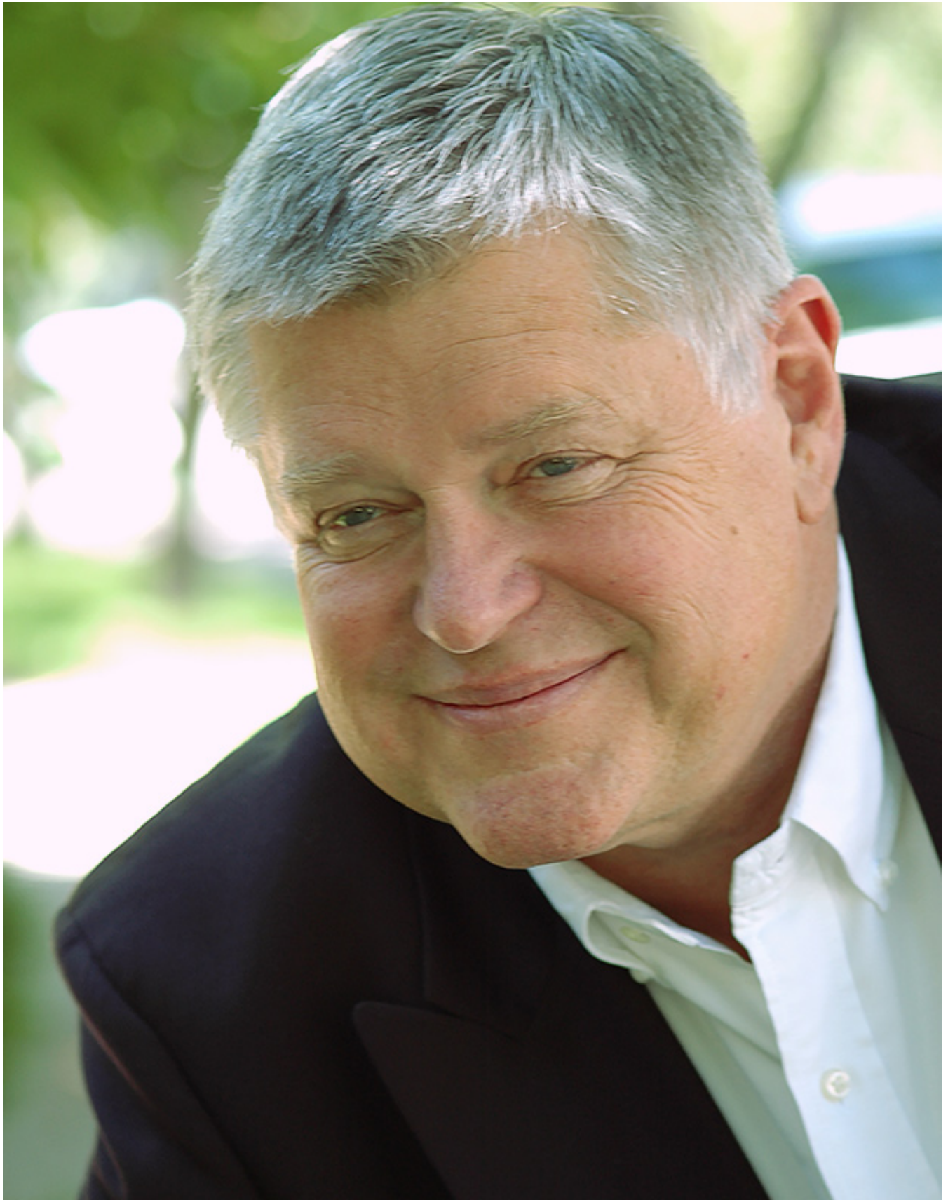
Glenn Doman Down Syndrome